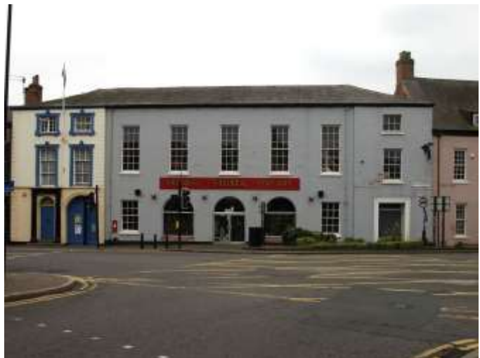
Former Opera House - Ripon (listed building)