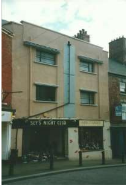
Palladium Cinema - Ripon

The Palladium Cinema was smart and modern. The 'Opera House' opposite was very old-fashioned and drab. We didn't go there, that I can remember. A lot of time has passed and with it some of the old 'rock-solid' businesses such as Timothy Whites and Taylor's (pharmacists), Freeman, Hardy and Willis (footwear) - and of course F.W. Woolworth, the latter replaced but without the same 'class', by the 'Pound' shops. And is Glover's garage - 'AA...RAC' - still in the corner of the square - or is it integrated into a multi-million pound auto facility just outside town?