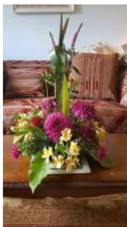
Some of the displays