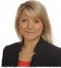
Kirstene Hair MP