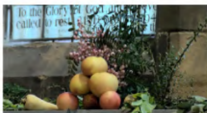
Memories of our Harvest Thanksgiving Service